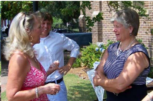
A meeting of the minds with Becky, Steed and Patsy.